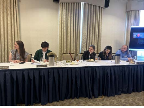
The future of Rotary is in great hands! A special treat, the DC Rotary Club hosted 8 out of the 11 RYLA students they sponsored this year that same day so they can hear all about the Rotaract Program!