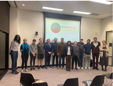
Food Justice DMV Service Event