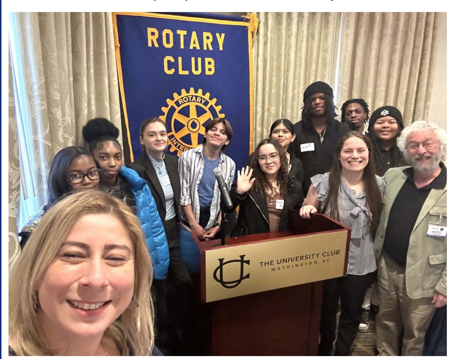
APR - Rotaract Club of Washington, D.C.